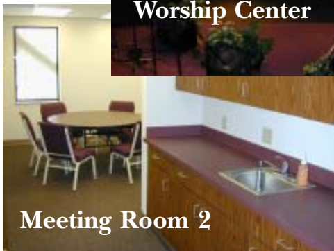
Meeting Room 2