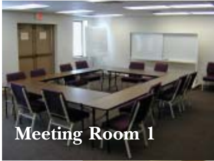
Meeting Room 1