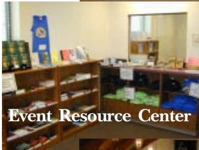
Event Resource Center